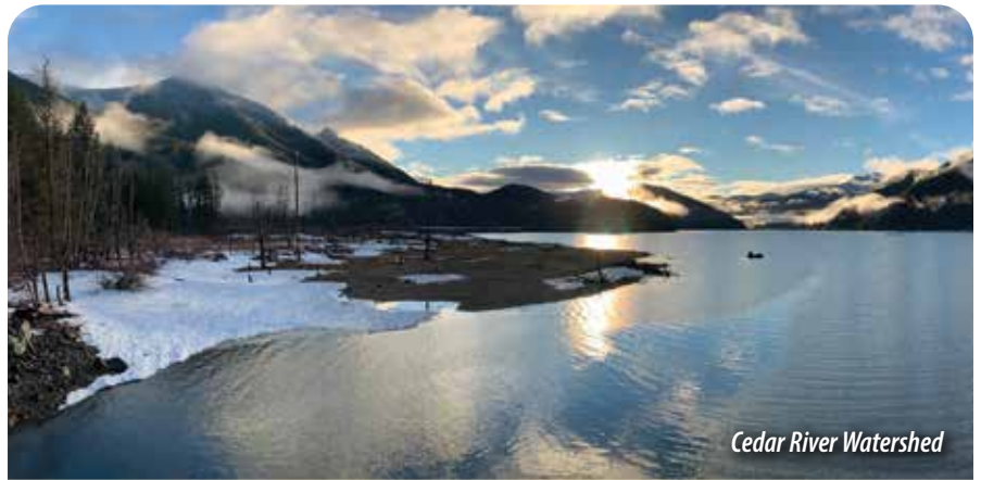
Cedar River Watershed

Give us a call for more info: (425) 235-9200