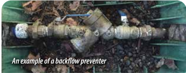
An example of a backflow preventer

Should you wish to make a comment during a meeting, please contact us in advance—before Noon on the day of the meeting at the very latest—by email at: customerservice@ccud.org